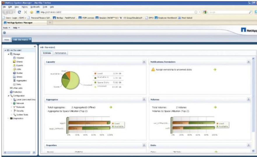
Figure 2) You don't need to be an expert to configure your storage with the simple, easy-to-use NetApp System Manager console.

Visit netapp.com/cloud to find out more about our full range of cloud offerings.